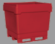
MONSTER COMBO® BINS