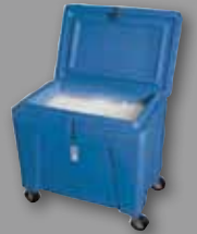
DRY ICE CONTAINERS