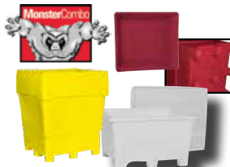
Single Wall Bins