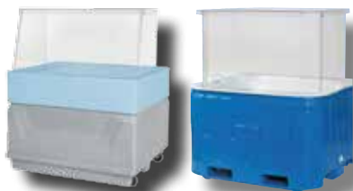
Polar ® Merchandisers