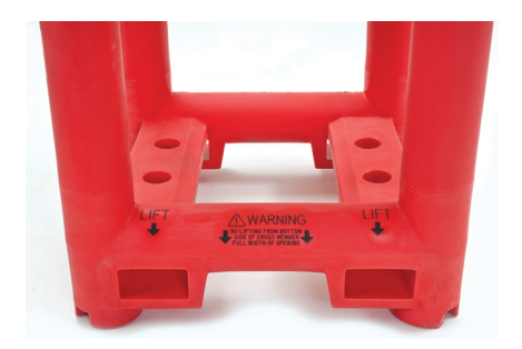
One piece SEALED sanitary base design is 2-way forklift and pallet jack accessible and comes in a variety of colors to help designate specific applications.

45° or 60° Standard Hopper Angles other hopper angles available upon request.