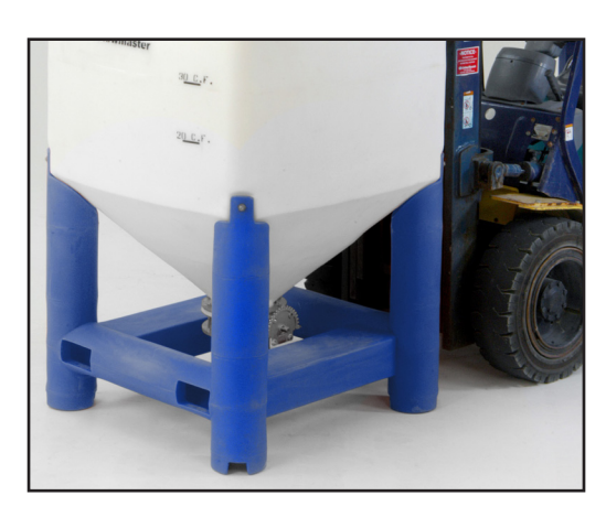
Optional Base Colors Thick walled, all-plastic base is available in a variety of colors to help designate specific application.