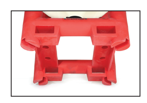
Sanitary Base Design