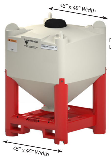
U.S. Patent #7,475,796

Translucent Polyethylene Bottle allows users to view material usage through tank wall without using level indicator.