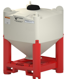
Standard Closed Top Design

Notes: All dimensions & capacities are approximate. Bin capacities are based on water-filled capacity. Other custom sizes, hopper angles, and dimensions available upon request.