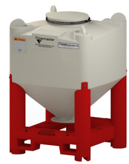
Sanitary Closed Top Design