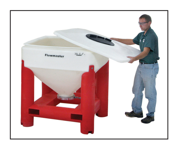
Open and Closed Top Designs

Multiple top opening configurations are available to meet specific application requirements.