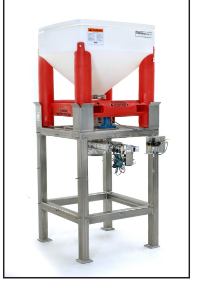
Discharge Stations are designed to provide dust free transfer of dry materials. Options include screw conveyors and vibratory feeders.

Multiple top opening configurations are available to meet specific application requirements.