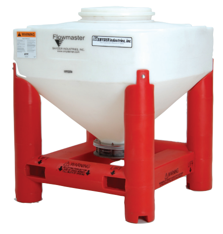
No top lift design with 22" sanitary lid.